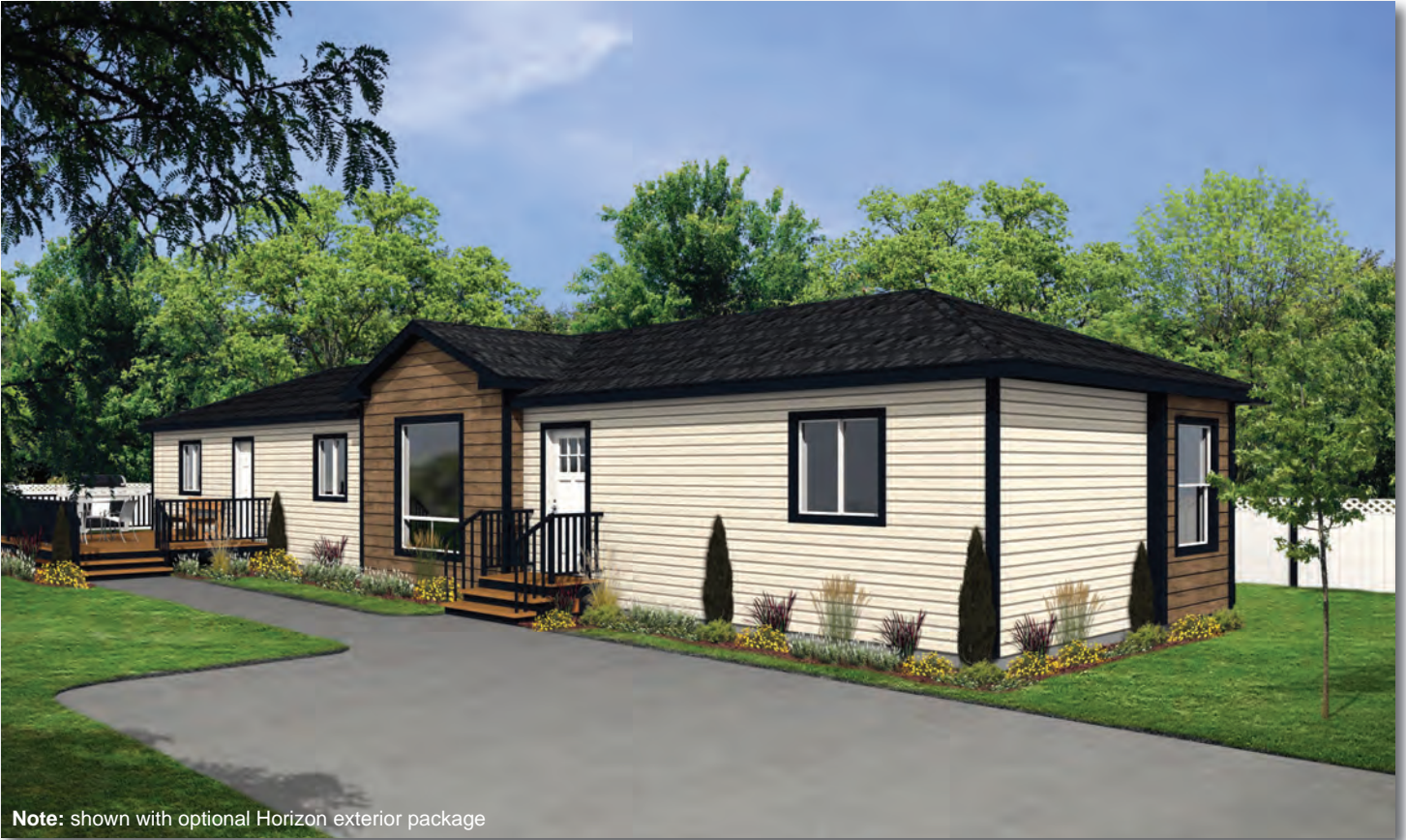
Note: shown with optional Horizon exterior package